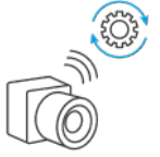
Ready for remote update